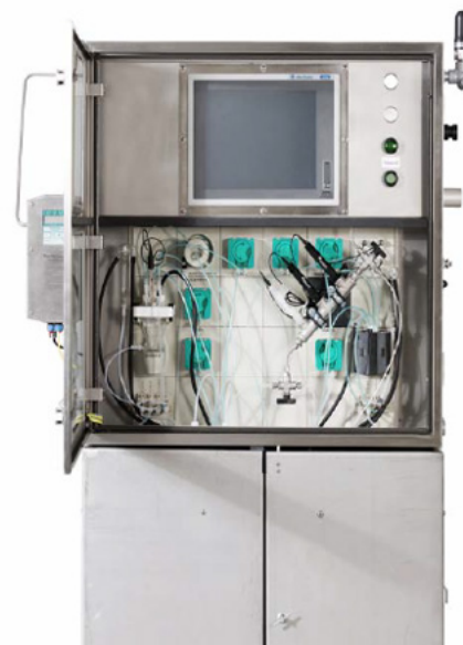
FIGURE 1: 3D TRASAR CRUDE OVERHEAD SYSTEM EQUIPMENT